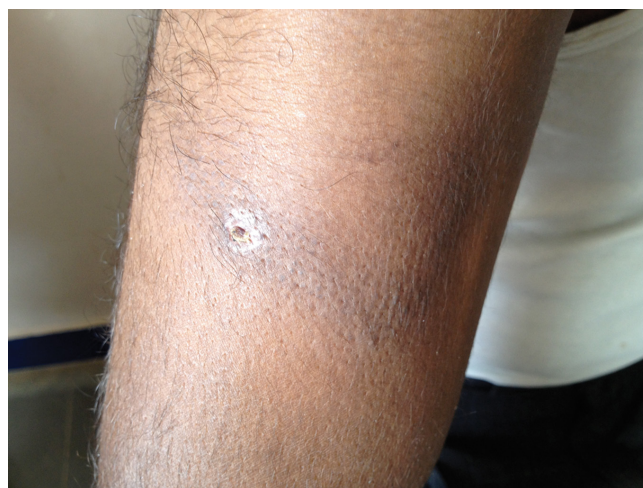
Figure 2. After wiping with Isopropyl alcohol, biopsy site