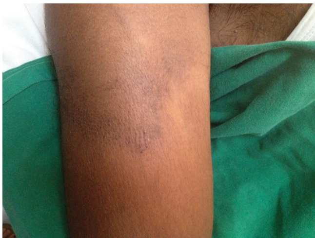
Figure 1. Brownish pigmented patches