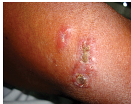
Figure 2a. Before treatment. b. After 6 laser sessions

The response of patients with Cutaneous Leishmaniasis for Low Level Laser Therapy was excellent in the majority of treated patients (92.3%) in a relative short time. LLLT proved to be successful, safe procedure and the complications were minimal and transient. The clinical response was not related to demographic data (age, sex and tribe) or specific factor (family relation, morphology and site of the lesion) but an obvious relation was established for the duration of the lesion in respect to the number of sessions needed.