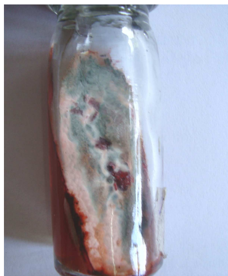
Fig. 1 Growth of P.marneffei on SDA at 25 0 C with diffusable red pigment

P. marneffei is a dimorphic fungi. At 25°C on SDA grows as a mycelial fungus producing rapidly growing greenish yellow sporulating colony with a red centre and dark green edges with diffusible brick red pigment (Fig.1). At 37°C on SDA it produces smooth glabrous off white yeast like growth with little pigment (fig. 2). Microscopically the fruiting heads sometimes have terminal conidia larger than the ones beneath them called Corda's phenomenon, characteristic of P. marneffei (fig. 3).