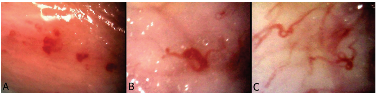
Figure 2. (A). Image video capillaroscopy by 200X in nail fold. Nail fold telangiectasia consist of very enlarged vessels. (B). Image of lower lip mucosa. Mega capilar. (C). Image of lower lip mucosa. Bushy capilar.