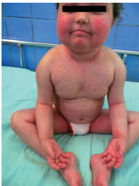
Figure 3. A buffalo hump, central obesity, gynecomasty, subcutaneous hypertrophy.