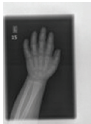
Figure 4. The growth retardation.

After 6 months of treatment laboratory values revealed blood cell count with platelets, electrolytes, total cholesterol, thyroid hormones - tests within normal limits. Morning cortisol level at 8.00 am- 353nmol/l. The Synacthen test – still showed adrenal insufficiency- the continuation of therapy was demanded.