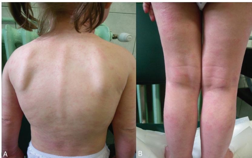
Figure 6a, b. The disappearance of hirsutism after 6 months of treatment.

Iatrogenic CS with hypothalamic-pituitary-adrenal axis suppression through the misuse of topical glucocorticosteroid therapy with Mometasone, is a very rare case. To our knowledge, our patient is the first one with atopic dermatitis who developed Cushing's syndrome after Mometasone application.