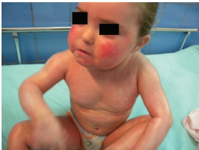
Figure 1. Facial fullness, redness, acne and a moon face.