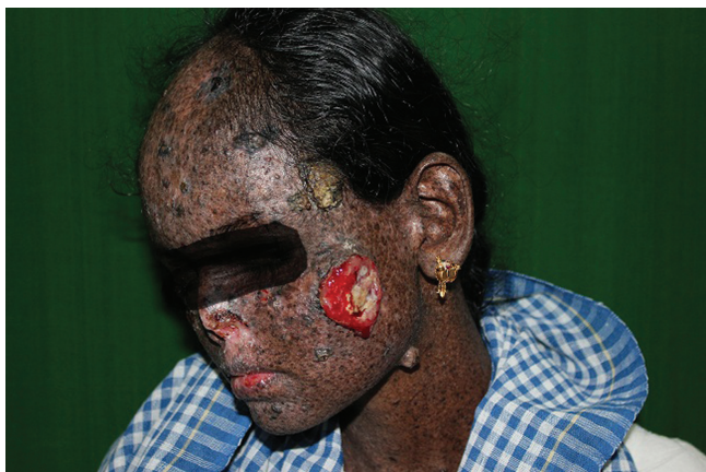
Figure 1. Pre operative picture showing the lesions on the face including a large ulcerated lesion on the cheek.