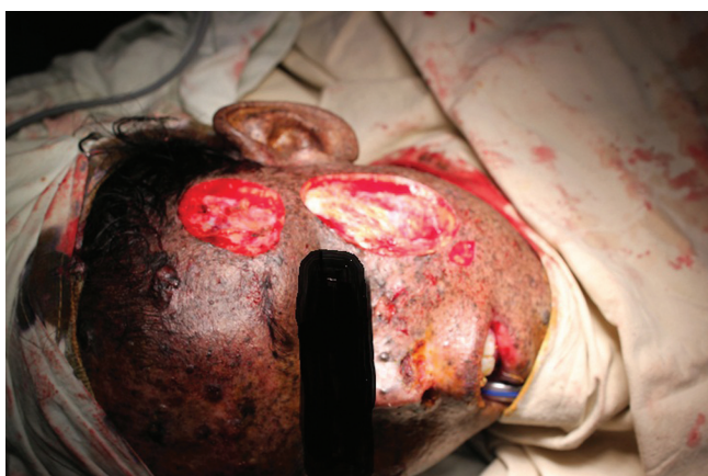
Figure 3. Intraoperative picture after a wide local excision was done.