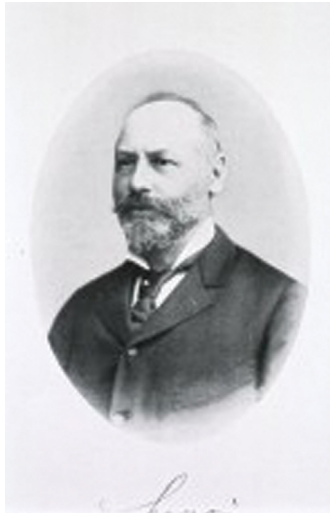
Figure 3. Moritz Kaposi (1837–1902). Reproduced from reference number 4.