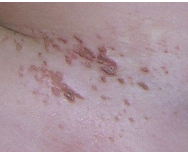
Figure 3. Close up of the neck fold lesions