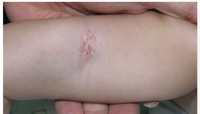
Figure 4. Clinical appearance of granular parakeratosis in the antecubital fossa of the patient