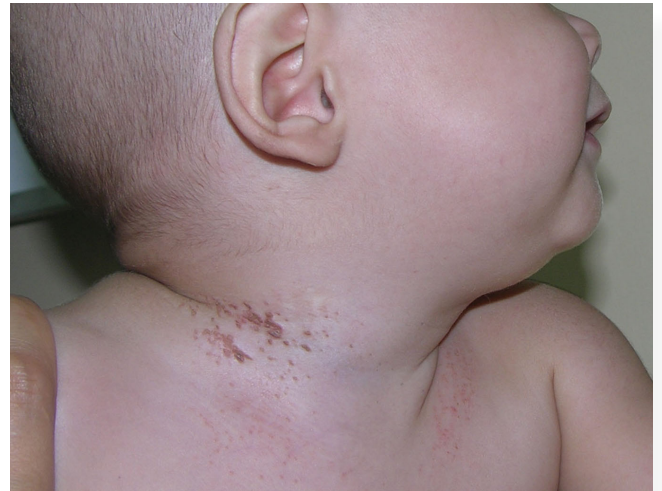
Figure 2. Multiple brownish-red scaly papules that focally coalesce located on the neck fold of the patient