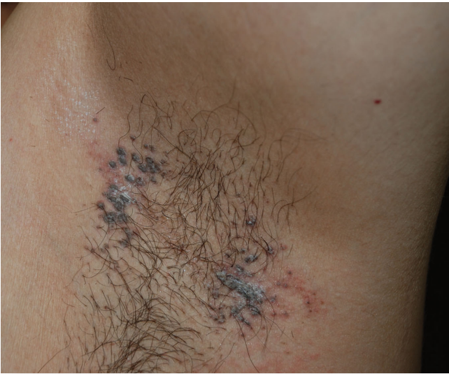
Figure 1. Papillomatous axillary rash