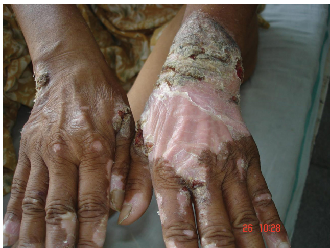
Figure 1. Scaly plaque on the wrist over a depigmented patch before treatment

To conclude, we report the co-existence of vitiligo and psoriasis with few colocalized lesions. Many pigment cell biologists and dermatologists have concluded that vitiligo is an autoimmune disease and psoriasis, the T cell mediated skin disease [18], may be associated. Whether their interpretation of the association is valid is uncertain. This requires further insight into their pathogenesis, as we believe that psoriasis and vitiligo are spectra of diseases with varied etiology for varied clinical presentation [19].