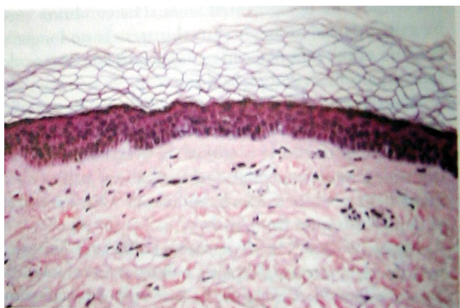
Figure 3. Photomicrograph of depigmented patch showing absence of melanocytes in the basal layer