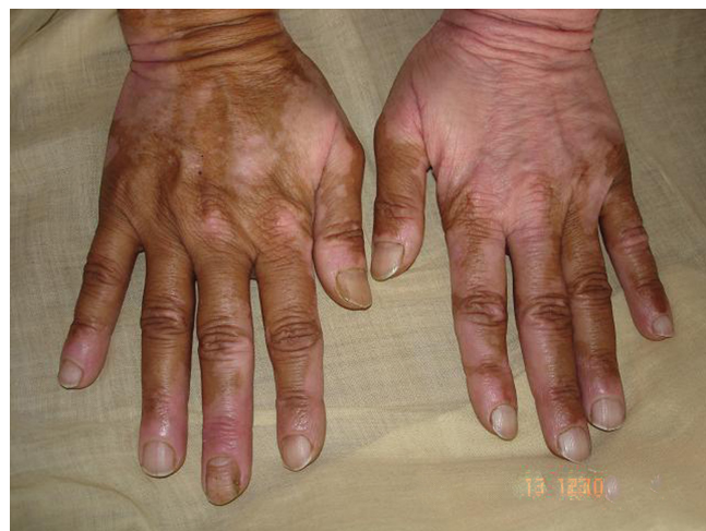
Figure 4. Wrist after 12 weeks of treatment