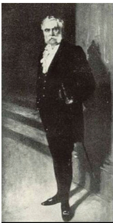
Figure 3. Douglas Moray Cooper Lamb Agryll Robertson

Scottish ophthalmologist and surgeon, 1837-1909 (Fig. 3). After earning his degree in 1857 from the University of St Andrews, he went to Berlin to study under Albrecht von Graefe. Robertson spent most of his medical career