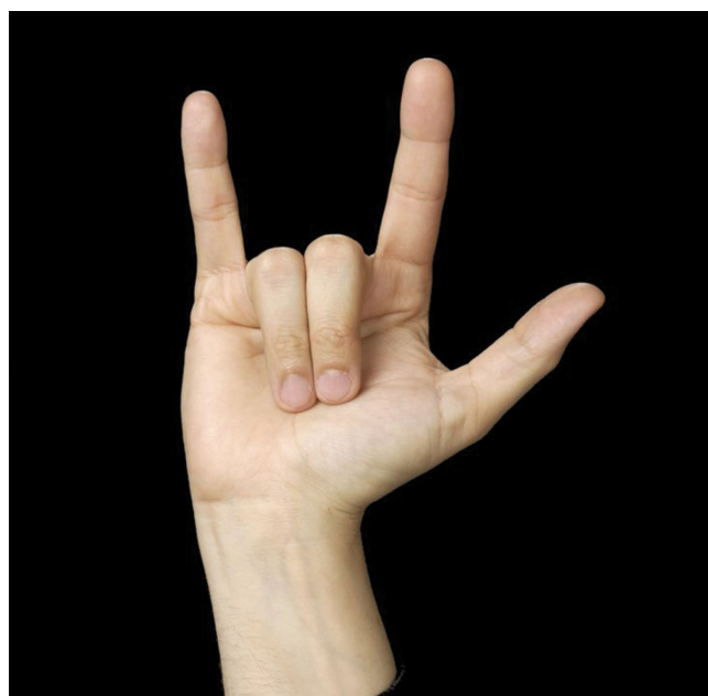
Figure 1. „I love you” sign