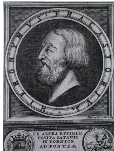
Figure 4. Hieronymus Fracastorius

Physician, astronomer, a naturalist, a poet and a philosopher, 1483-1553 (Fig. 4). The poem Syphilis sive morbus gallicus was published by Fracastor in 1530.