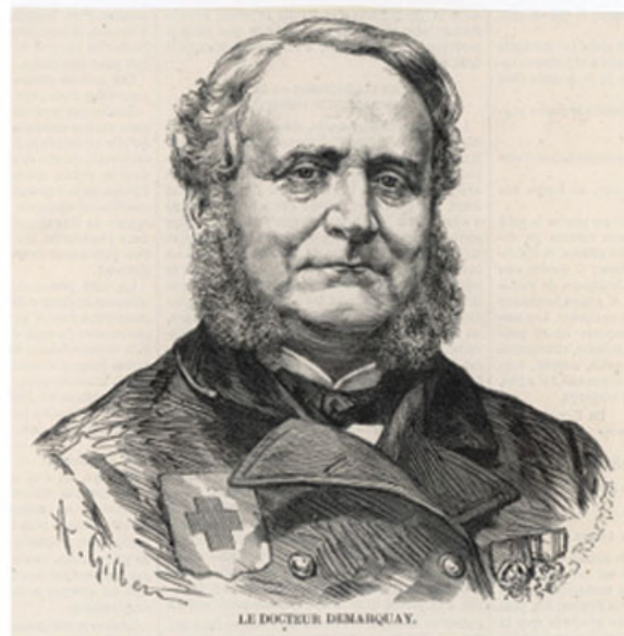
Figure 5. Jean Nicholas Demarquay

French surgeon, 1814-1875 (Fig. 5). In 1863, became the first to record the observation of microfilariae in fluid extracted from a hydrocoele (another common symptom of lymphatic filariasis) [19].