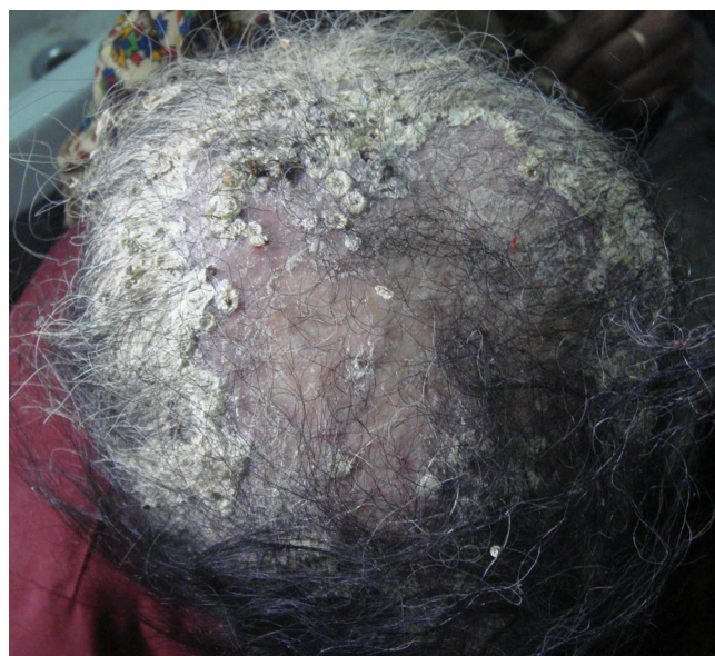
Figure 6. Honeycomb sign Celsi