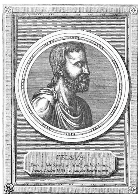
Figure 7. Aulus Aurelius Cornelius Celsus

(ur. ok. 25 p.n.e., zm. ok. 50), pisarz rzymski w medycynie i chirurgii. Napisał wiele dzieł, z których tylko jedno pozostaje kompletne jego traktat De Medicina w ośmiu ksiągach. Mieszkał prawdopodobnie w Gallia Narbonensis [6].