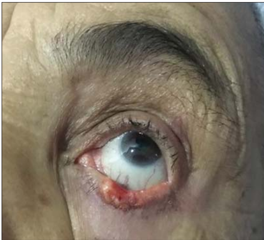
Figure 1: Preoperative presentation of the sebaceous carcinoma.