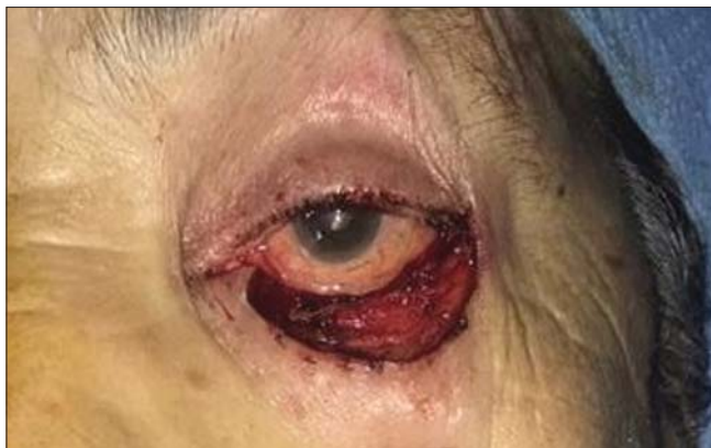
Figure 2: Intraoperative aspect after tumor excision.

stage of disease. Redness is often found associated with eyelid swelling. This change in volume can either take on the appearance of a nodule or from diffuse infiltration of the entire eyelid. The diagnosis most often mentioned at the initial stage is that of chalazion or meibomian cyst. At more advanced stages, when the lesion resists local treatments or surgical drainage, the diagnosis most often mentioned is that of squamous cell carcinoma, basal cell carcinoma or even lymphoma. The treatment is surgical. It consists of a complete resection of the lesion associated with wide safety margins (more than 4 mm). Intersections with extemporaneous histopathological examination seem essential. Only a wide resection with, if necessary, reconstruction on an unevolved (non-metastatic) tumor allows healing [1,4-7].