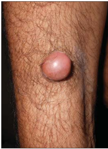
Figure 1: A solitary nodule on the forearm.