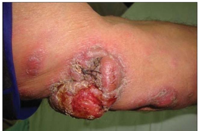
Figure 1: Multiple vegetating tumors on the left arm.

Besides, histopathology and an immunohistochemical study are the key to the diagnosis of PCALCL.