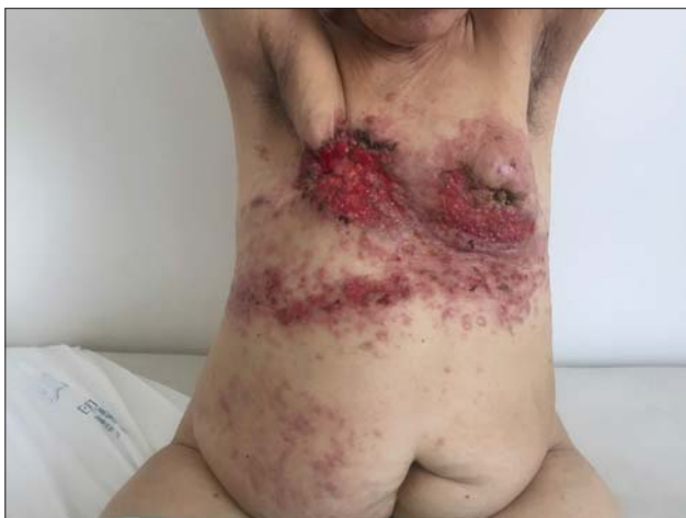
Figure 2: Erythematous and indurated papulo-nodular eruption with ulcerated and crustal lesions on the breast regions, thorax and abdomen.