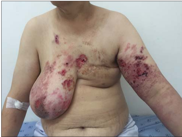
Figure 1: Lymphoedema of the left upper limb with erythematous maculopapular lesions and multiple ulcerations in the arm, trunk and breast regions.

After making the diagnosis of CLC, the patients were referred to an oncology center for management.