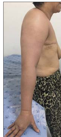
Figure 3: Lymphoedema with erythema and swelling of the right upper limb.