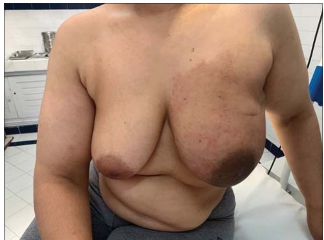
Figure 4: Indurated and enlarged breast with erythema.