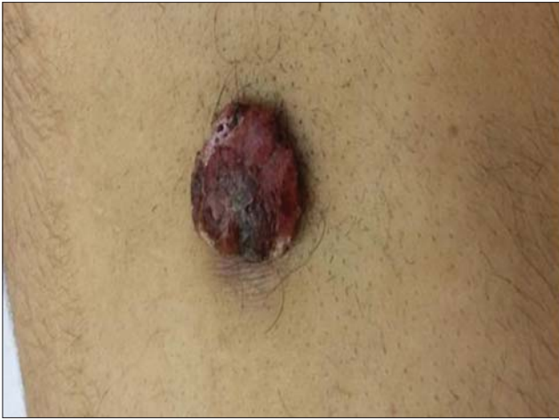
Figure 1: Lesion of verrucous carcinomas simulating botriomyoma.