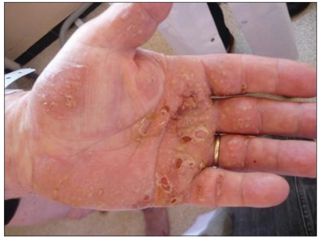
Figure 1: Palmar bullous eruption.

The classic PNP described by Anhalt in 1990 in the 45-70 age group predominated in males and the associated diseases were lymphoproliferative diseases and adenocarcinomas. Clinically, erosive and ulcerative mucosal lesions are consistent signs of the disease and skin lesions are polymorphic [1-3]. Our observation is distinguished by the purely cutaneous involvement at the clinical level. This atypical form without mucosal involvement was described by Kennedy [4] in 2009 in a 78-year-old woman with recurrent endometrial cancer. The antibodies desmoglein 1 IgG and 3 IgG, BP 180 and BP 230 were negative; however, the direct immunofluorescence was positive for the inter-cellular IgG and C3 staining and the presence of antibodies anti-envoplakin, anti-periplakin and desmoplakin 1 and 2. This negativity of the indirect immunofluorescence was described by Wong [5]. According to Wong [5], these are modified criteria for the PNP. Moreover, this negation