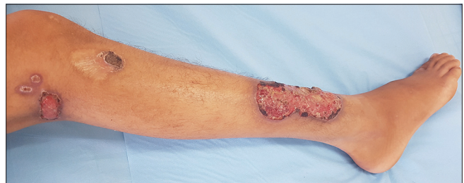
Figure 1: Right leg's ulcerations.

The histological examination revealed A moderately dense superficial and deep lymphoplasmocytic infiltrate around the vessels (Fig. 2), confirmed the diagnosis of PG. A report looking for associated diseases revealed no anomalies. Oral corticosteroid therapy at a rate of 1 mg/kg/day allowed the healing of lesions with good progress.