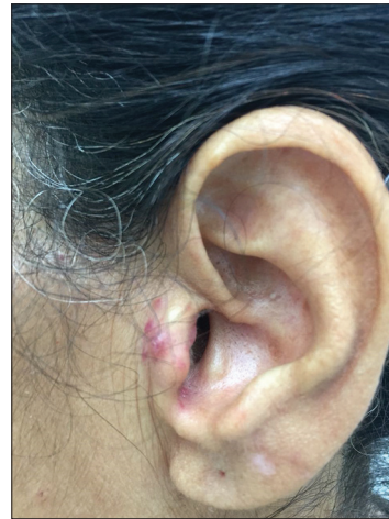
Figure 1: Erythematous-violaceous papules located on the tragus.

On histopathology ALHE disease usually does not resemble lymphoid tissue, it is primarily a disorder of blood vessels and has structures similar