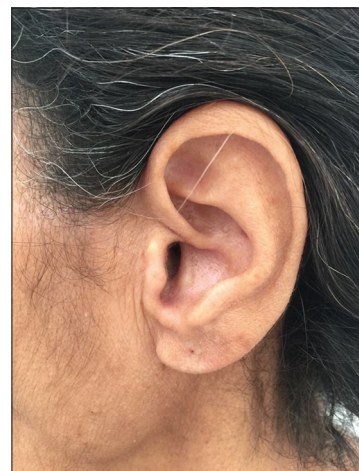
Figure 3: Clinical improvement 12 months after treatment.