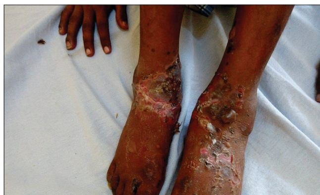
Figure 2: Skin lesions on the left forearm.