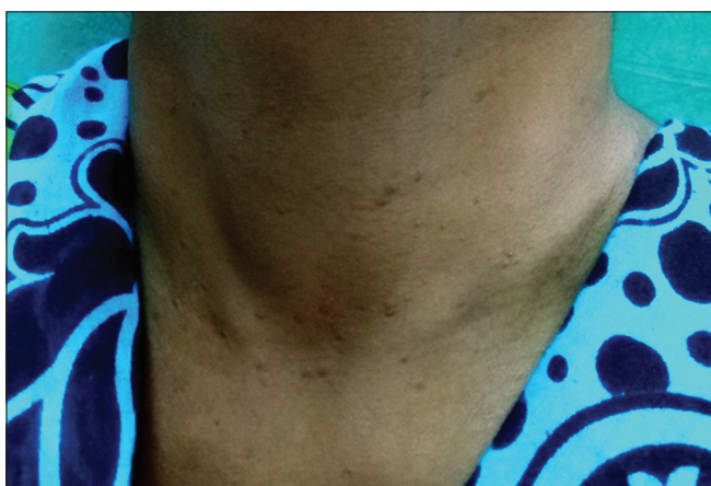
Figure 2: Multiple hyperpigmented papules over the anterior part of neck extending till the supra-sternal area.