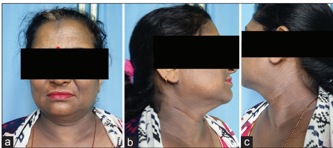
Figure 3: (a) Involvement of the cheeks and neck. (b) Sparing of neck folds. (c) Involvement of neck, and upper trunk while sparing the folds.