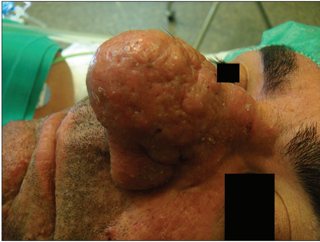
Figure 1: Port-Light Nose sign