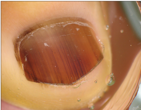
Figure 4: Pseudo-Hutchinson's sign

It is a hair shaft abnormality, where the hair shaft shows irregular, flattened, expanded areas that have