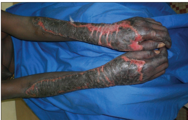
Figure 2: (b) Pot Belly sign