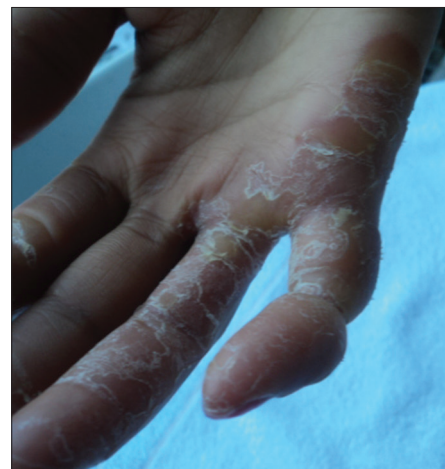
Figure 3: Pseudo-ainhum sign

Pseudo-elephantiasis is a condition, caused due to inflammation, edema or obstruction of lymphatics, triggered by non-filarial infections like donovanosis, lymphogranuloma venereum, syphilis, tuberculosis [24].