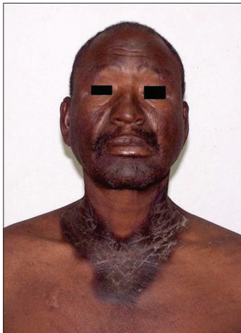
Figure 2: (a) Pot Belly sign