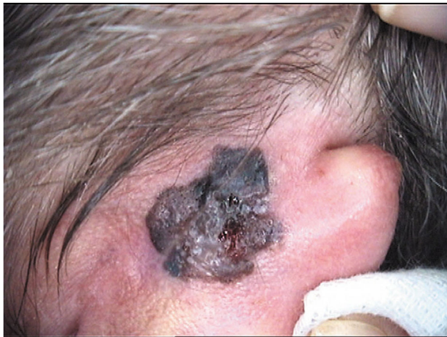
Figure 1. Superficial spreading melanoma

Histological testing by standard hematoxylin-eosin (HE) technique showed that it was a superficial spreading melanoma with a phase of vertical growth and multifocally present ulcerations of epidermis. The tumor reached papillary and reticular dermis, and dense lymphoplasmocytic inflammatory response was found in the infiltrative edge.