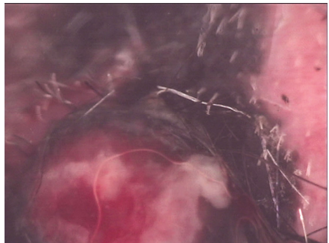
Figure 4. Dermoscopy of nodular melanoma