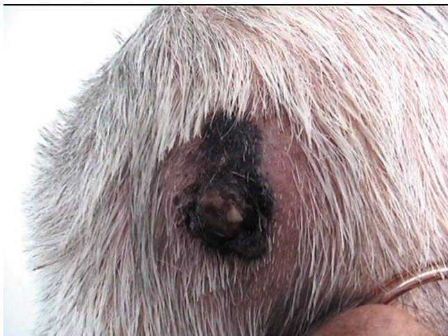
Figure 3. Nodular melanoma (NM)

Conclusion: Nodular melanoma from pre-existing epidermal-dermal nevus, Clark 4, level pT4b, Breslow 10 mm.