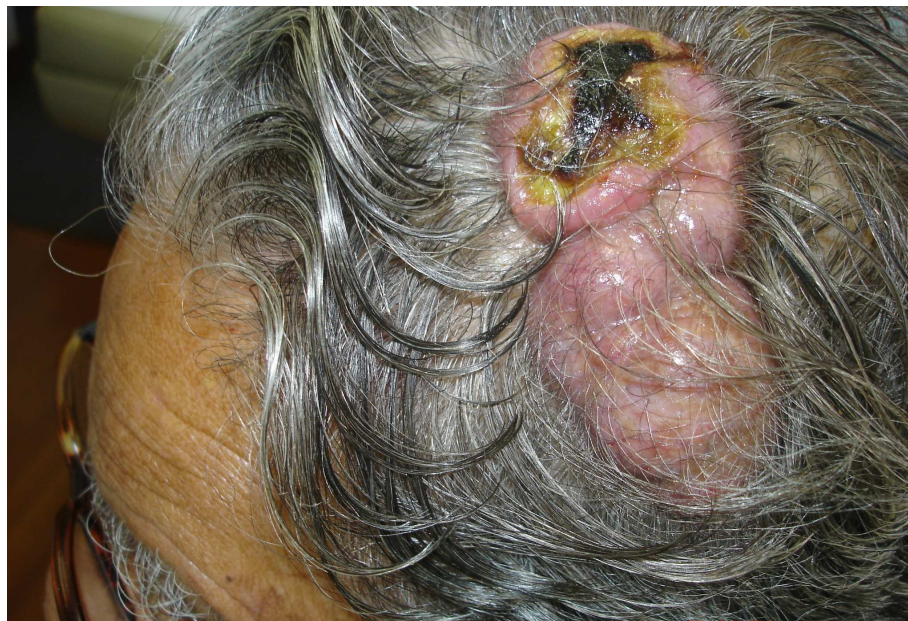
Figure 1, 2. Giant cylindroma