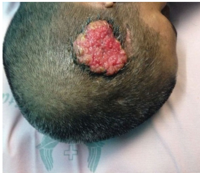
Figure 1. Clinical photograph of the ulceroproliferative growth over the right scalp

further provided support to the apocrine nature of the neoplasm (Fig. 3a, b, c). The margins were found to be free of tumour.