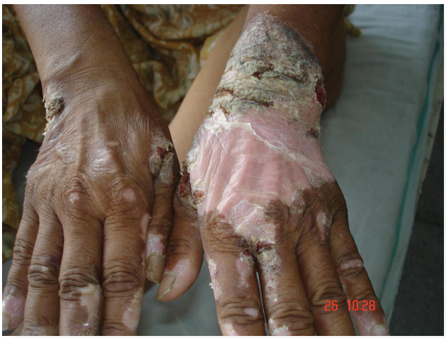
Figure 1. Scaly plaque on the wrist over a depigmented patch before treatment

Many susceptibility loci of psoriasis [12] and vitiligo [13,14] have been mapped and the subsequently locus for vitiligo. AISI, in chromosome IP 31, is situated close to the susceptibility locus for psoriasis PSORS7 [13].