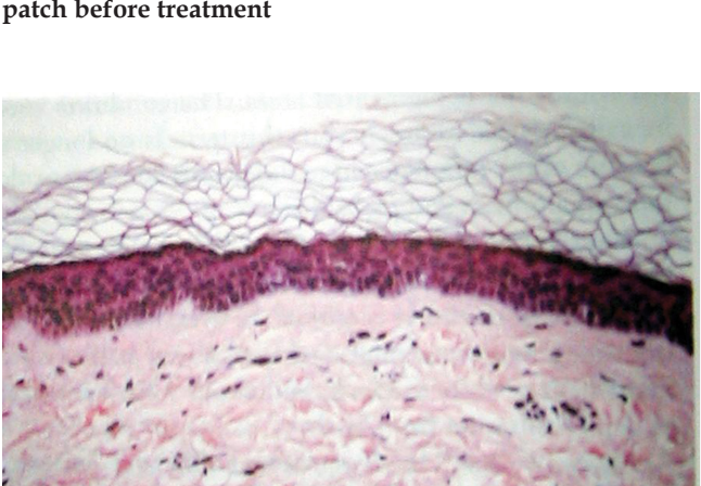
Figure 3. Photomicrograph of depigmented patch showing absence of melanocytes in the basal layer

Nevertheless, the possibility of loci being identical is minimized by the low prevalence of psoriasis in patients with