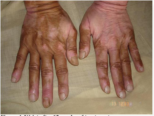
Figure 4. Wrist after 12 weeks of treatment