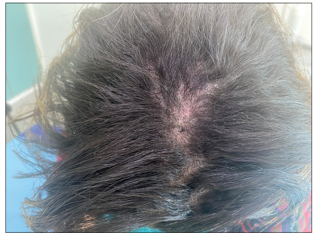
Figure 1: Clinical picture showing erythema on the scalp.

The authors certify that they have obtained all appropriate patient consent forms, in which the patients gave their consent for images