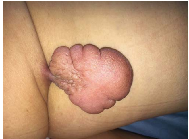
Figure 1: An erythematous pedunculated mass with an inflamed base in the buttock measuring 7 cm/6 cm.

The authors certify that they have obtained all appropriate patient consent forms, in which the patients gave their consent for images