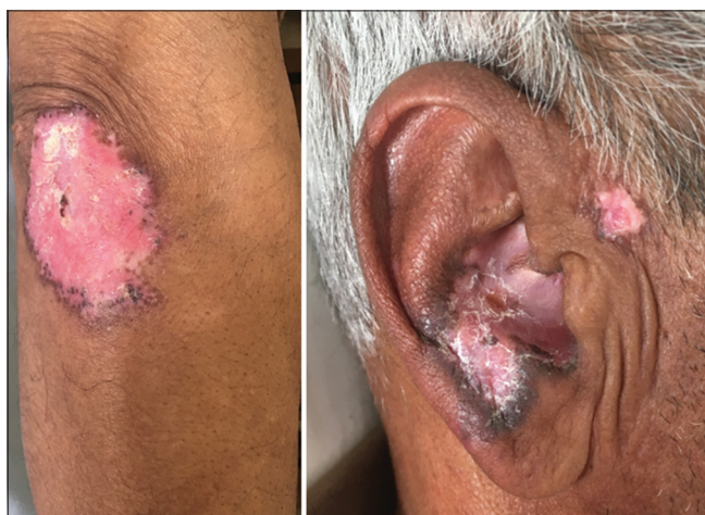
Figure 1: Erythematous plaques on the ear and elbow.