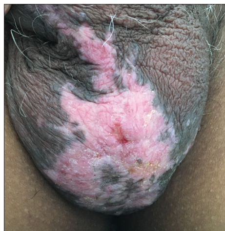
Figure 2: A well-demarcated, atrophic, erythematous, keratotic plaque with scales on the scrotal skin.

In all types of lupus erythematosus, skin lesions appear typically in sun-exposed areas [1], but rarely on the genitalia, with a few cases reported in the literature.