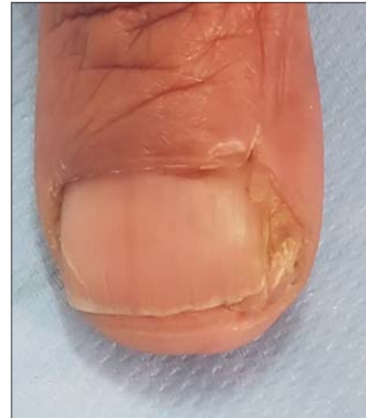
Figure 1: Periungual nodule of the right thumb.

The association of digital fibrokeratoma and subungual exostosis is unusual, it has been described by Cogrel in 2016 [1]. Both situations may be occur as a periungual