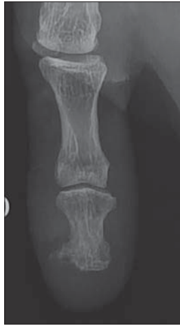
Figure 3: X- Ray examination of the right thumb showing the exostosis.

been described in both conditions [3], corresponding to epidermal hyperkeratosis in histology, the proximal white area observed in fibrokeratoma represent the dermal fibroblasts with collagen bundles.