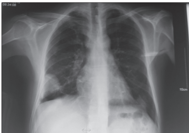
Figure 1: Chest X-ray showing well-circumscribed right basal opacity.