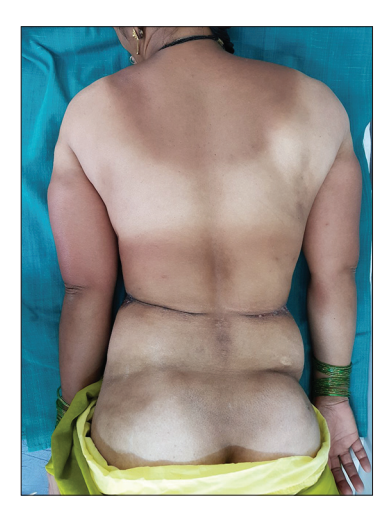
Figure 2: Loss of fat over upper third of arm and bilateral hip.

observation. She was counseled about the disease and was started on Tab Rosiglitazone 4mg OD and called for follow up.