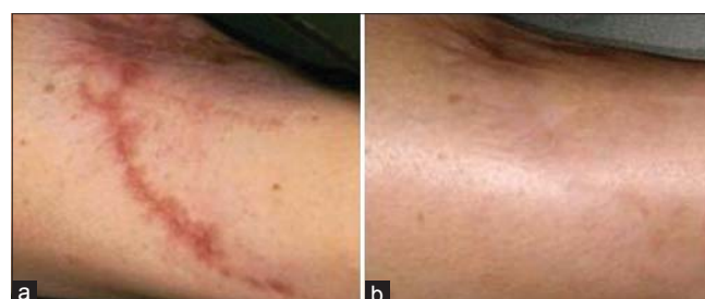
Figure 1: (a and b) A three months old scar before and after treatment.